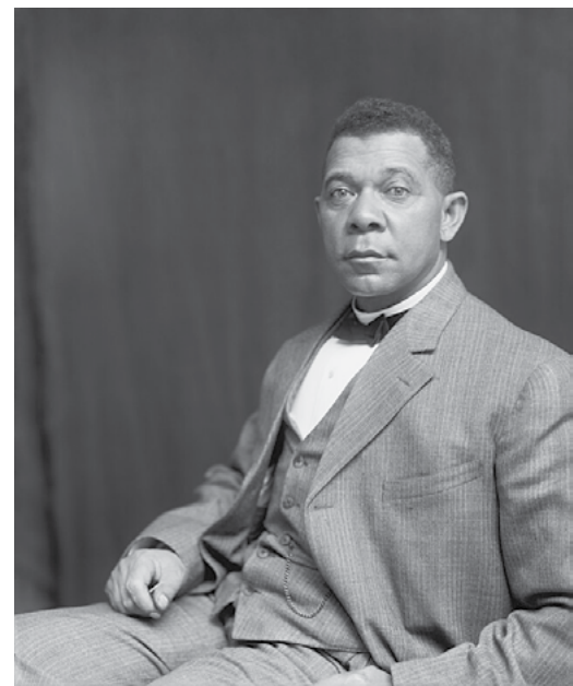
Booker T. Washington