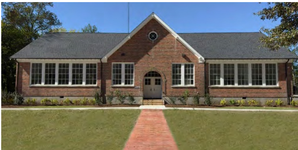
Cape Charles Rosenwald School